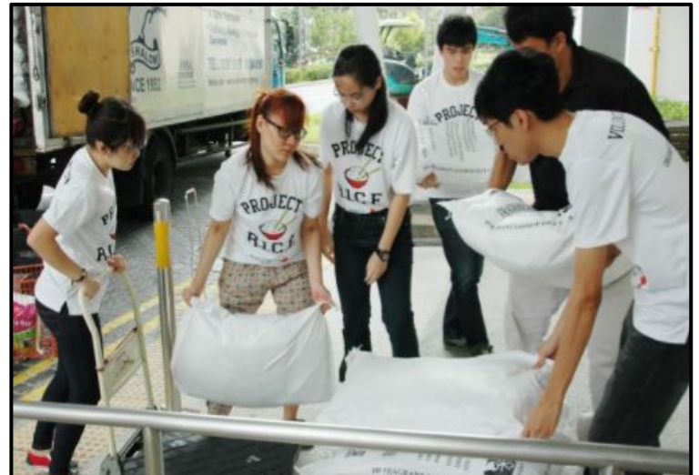
RED CROSS CHAPTERS