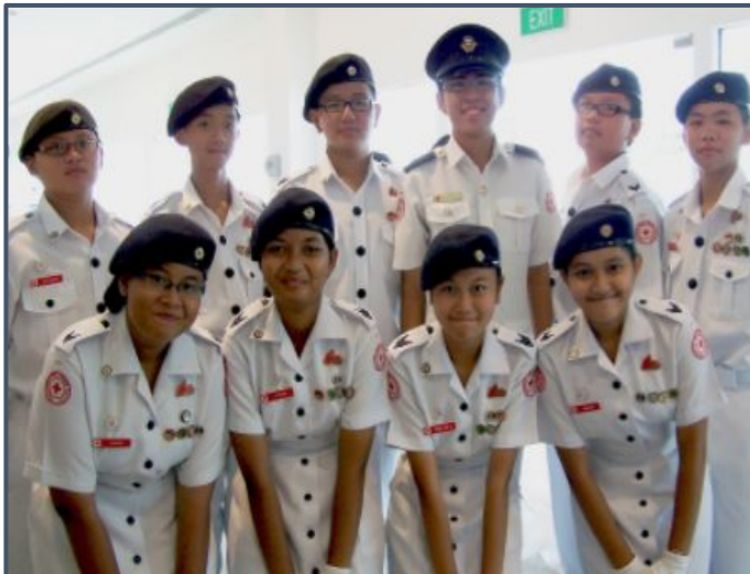
RED CROSS CADETS