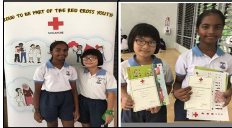
RED CROSS LINKS