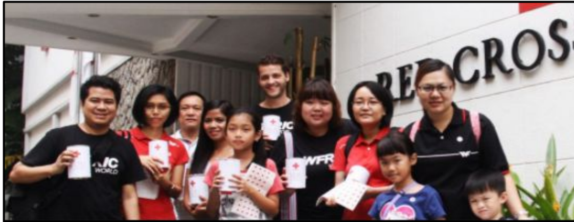
CORPORATE VOLUNTEERING GROUP