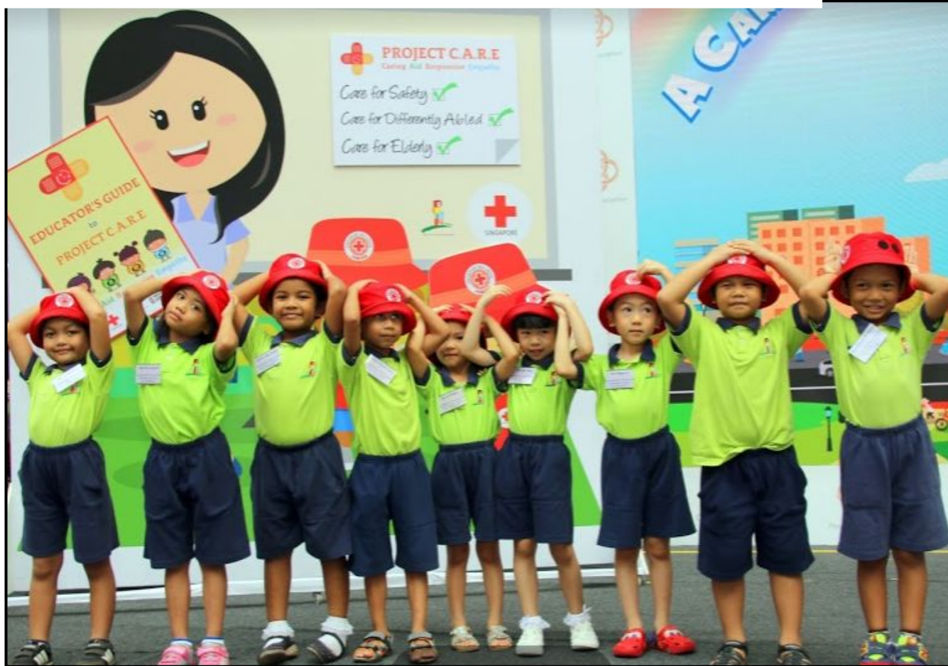
First 7 RCJ Clubs with Kidz Meadow