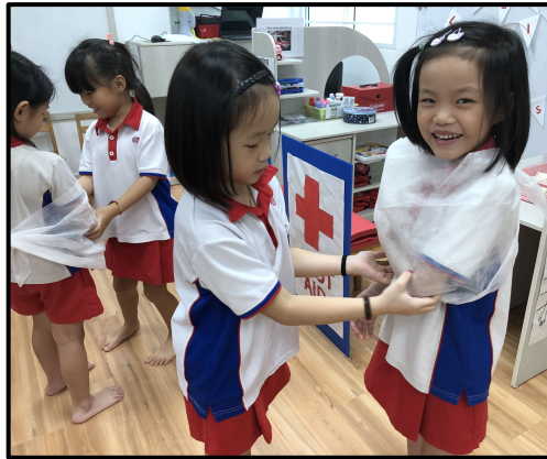
RED CROSS JUNIORS