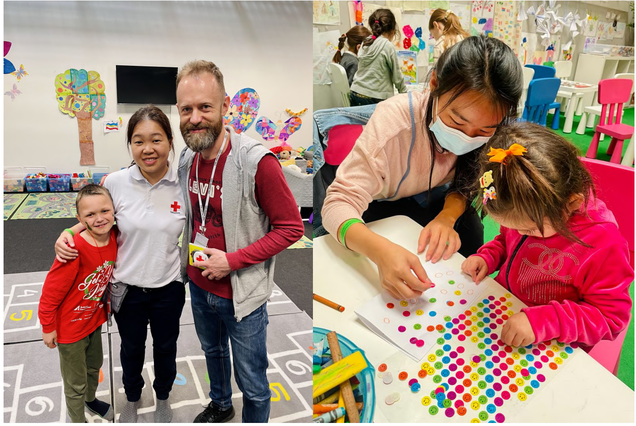
SRC deployed PSS-trained personnels to conduct PSS activities for Ukrainian refugees, specifically children at a Children Safe Space in a Refugee Reception Centre in Poland