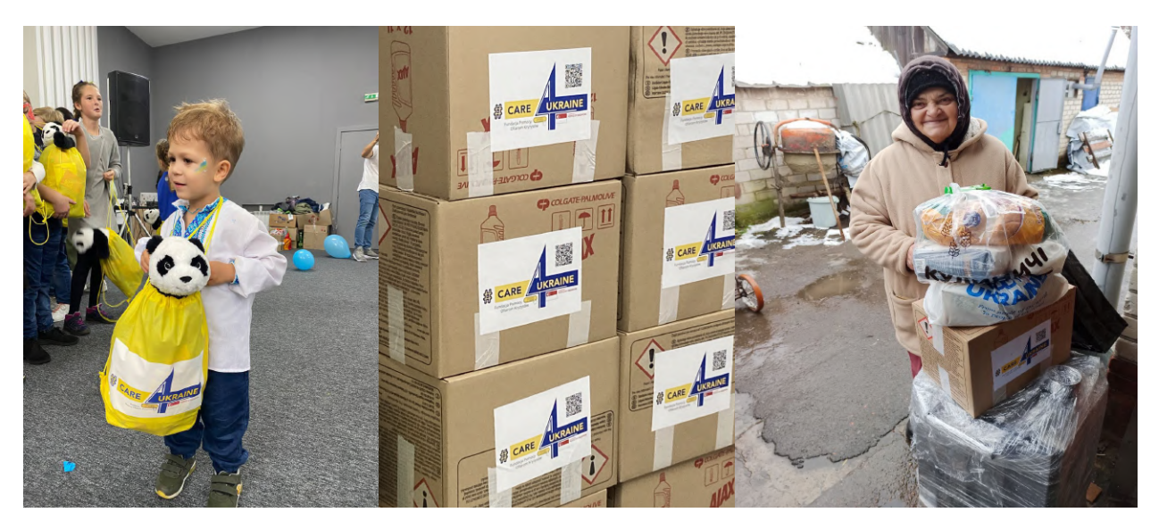
Working with a volunteer-led humanitarian organisation, SRC supported the #Care4Ukraine Programme which consists of 4 projects that provide relief assistance for the elderly, infants, new mothers, children and other vulnerable groups