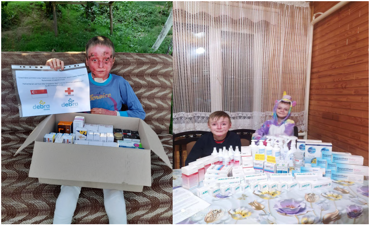
Recognising that there are many vulnerable groups in Ukraine that are often overlooked, SRC supported 120 patients with Epidermolysis bullosa (EB) and their families, a rare skin disease with medical supplies

SRC has also supported non-movement partners with the procurement of medical equipment to ensure the continuity of the hospitals' operation