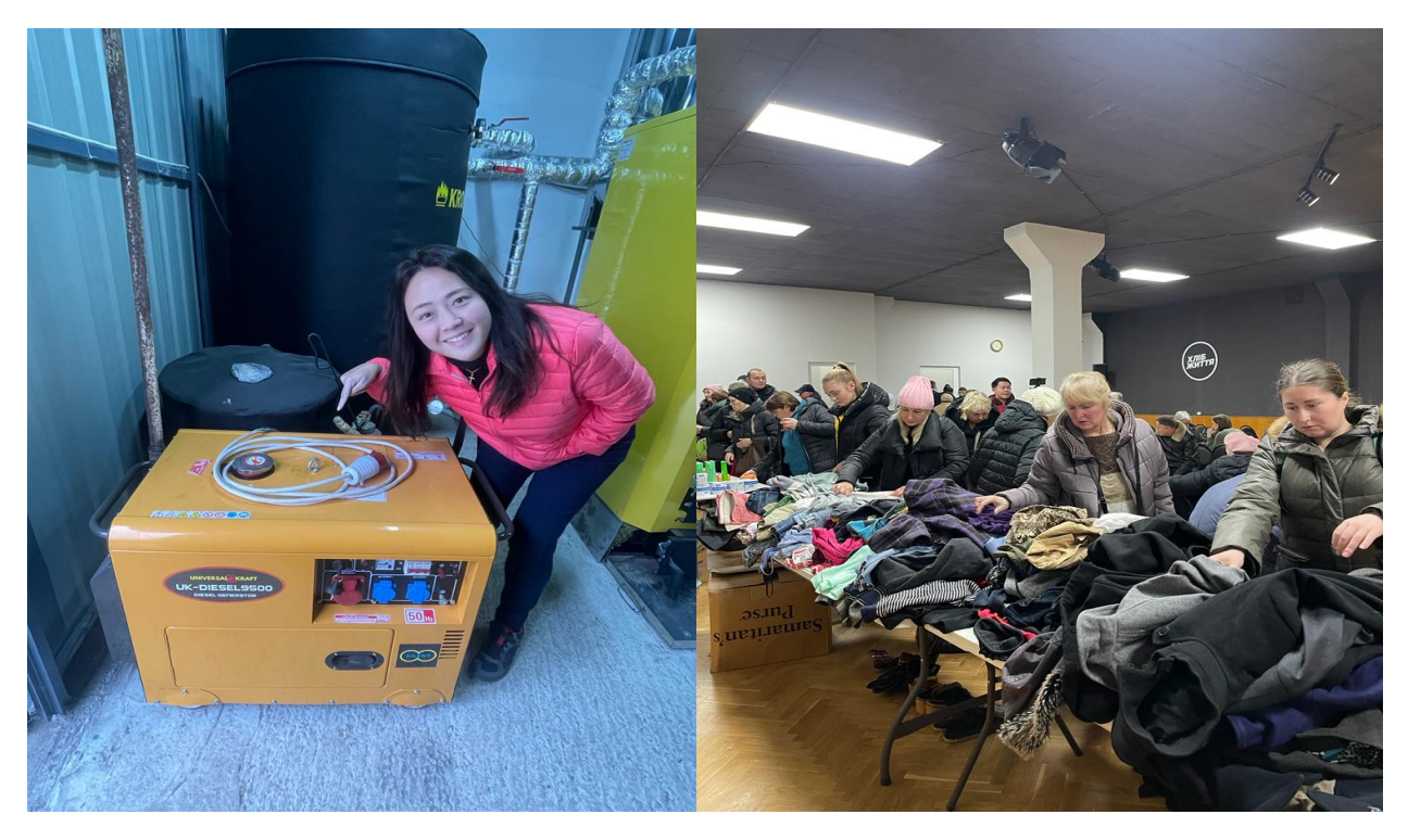
Responding to the urgent need for power generators at the end of 2022, SRC procured 6 power generators to keep the running of community facilities which are serving as relief and refuge centres for civilians.