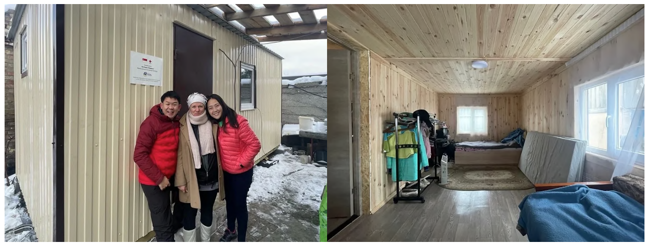
SRC partnered with Love On Ukraine which was founded by 2 Singaporeans to build modular homes that are winter-proof and relatively bomb-resistant for displaced families in Ukraine.